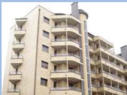
" There are more than 80,000 Cooperative Housing Societies in Maharashtra managed by CCRCS, Pune under Department of Cooperation, Marketing and Textiles"

A deemed conveyance is a document executed to transfer the title of land and building in name of the housing societies. Conveyance is a process in which the ownership of the land on which a particular building complex is built gets transferred to the housing societies. Many builders have not conveyed the title of the properties to the societies in the hope of availing more floor space index that may become available, or the benefits accrued to them in case the property is redeveloped. To stop this illegal practice, the government came out with a special law to enable societies get deemed conveyance