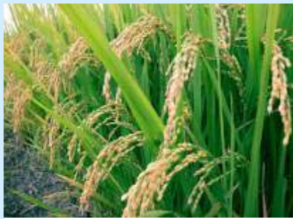
Department of Cooperation extends Crop Loan subsidy to the tune of 25,000 Cr to the farmers through various Financials institutions namely DCCBs/RRBs/Commercial Banks in Maharashtra